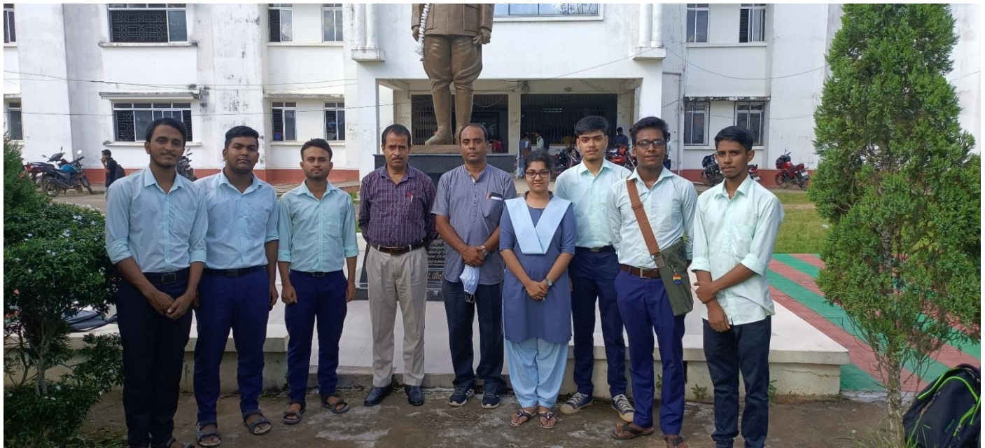
Biofloc trainees with the honorable principal and honorable HOD in-charge of Human physiology dept.